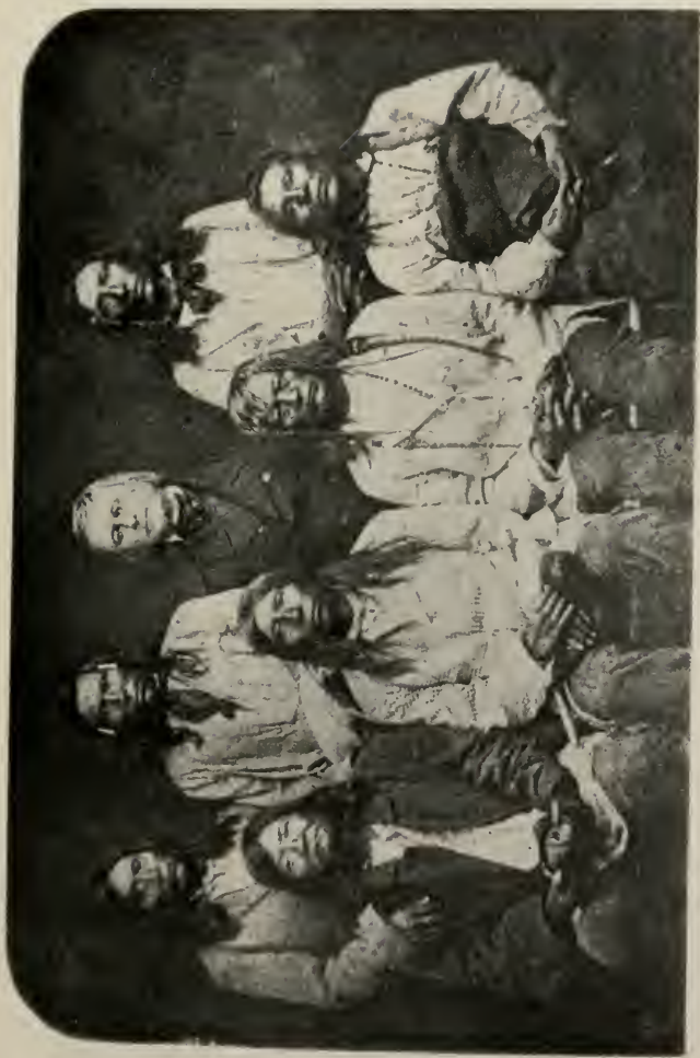
A DELEGATION OF INDIAN CHIEFS IN OREGON.