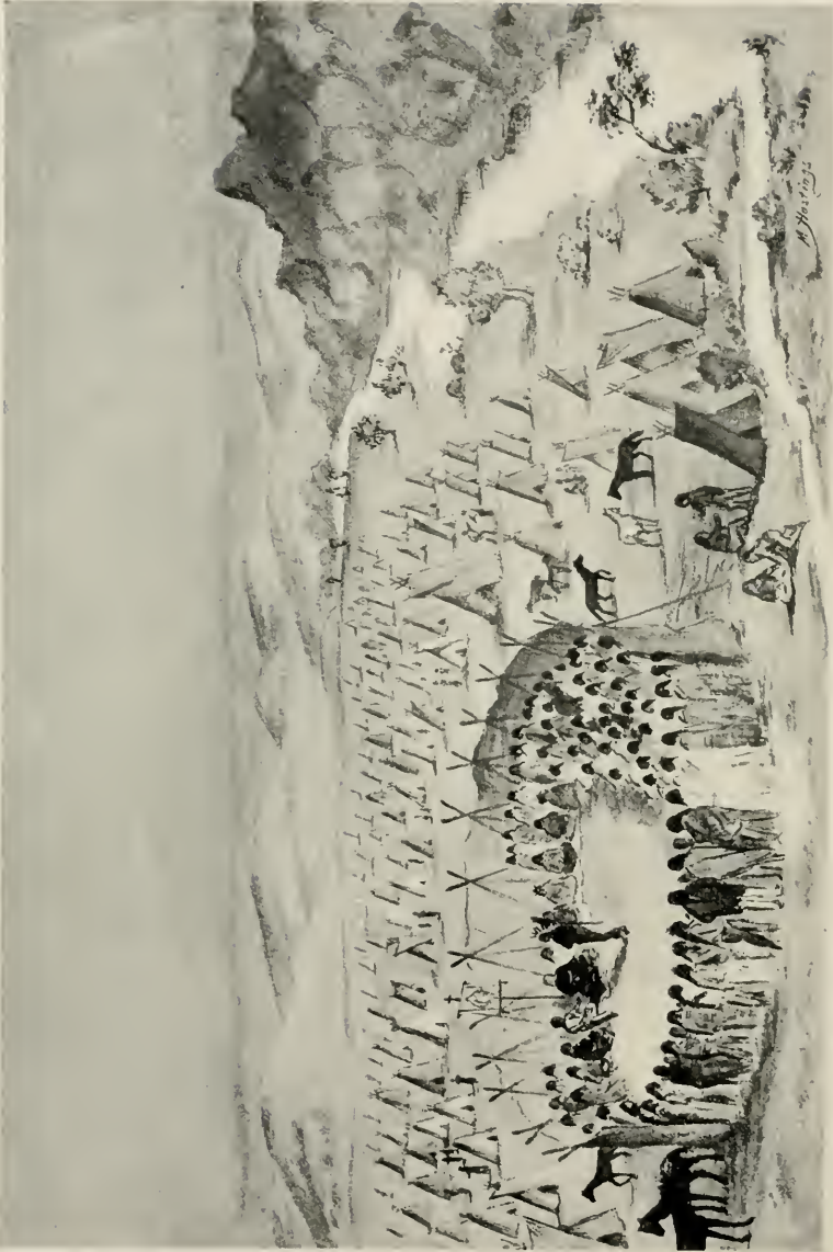
COUNCIL WITH THE HOSTILE SIOUX ON THE YELLOWSTONE RIVER.