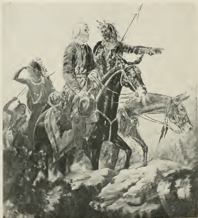
FATHER DE SMET RIDING WITH THE INDIANS.