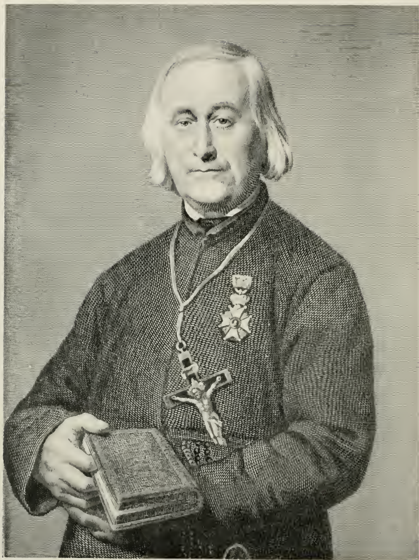
PORTRAIT OF FATHER DE SMET, SHOWING THE LEOPOLD DECORATION.