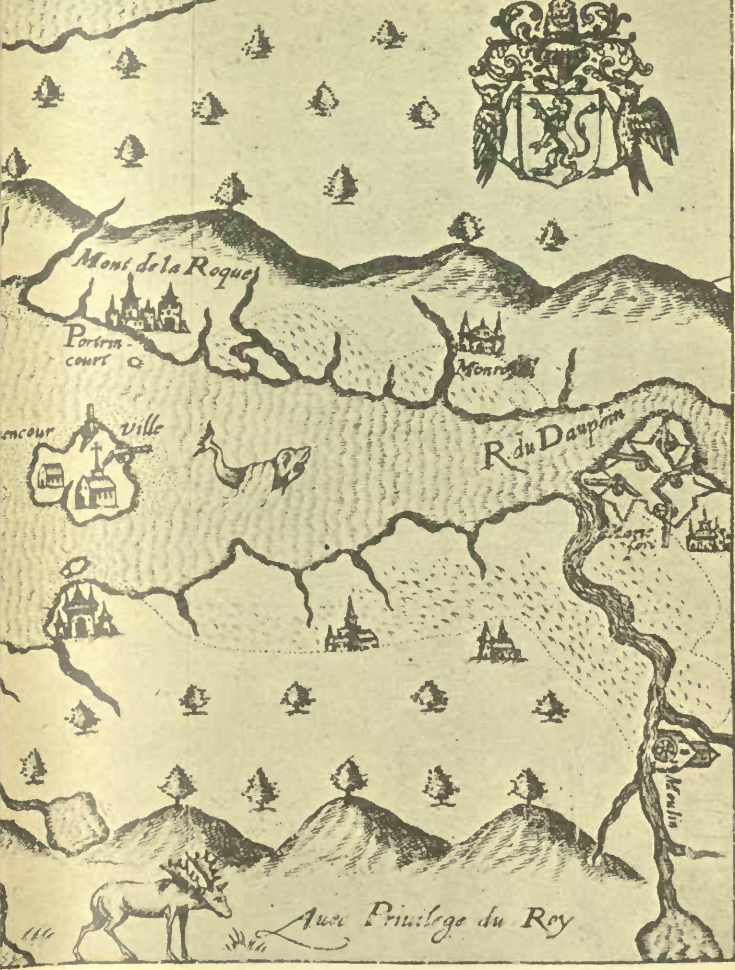
LLE FRANCE ; PARIS, 1612.