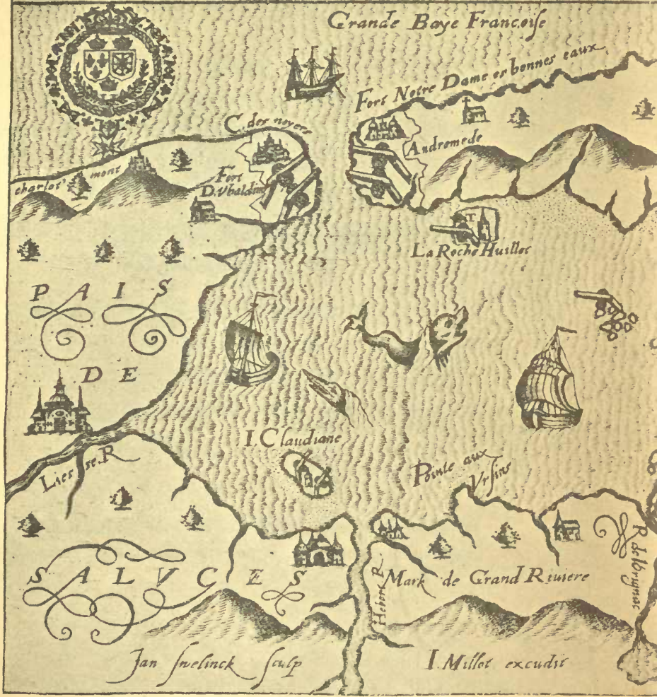
FROM LESCARBOT'S HISTOIRE DE LA NO