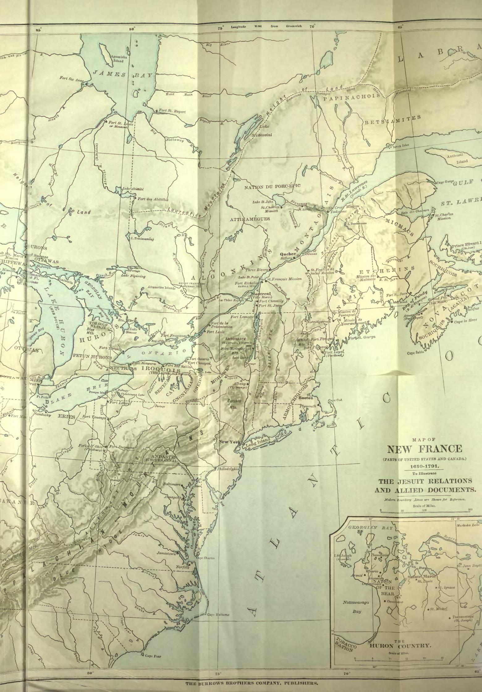
MAP OF NEW FRANCE (PARTS OF UNITED STATES AND CANADA) 1610-1791. To illustrate THE JESUIT RELATIONS AND ALLIED DOCUMENTS. Modern Boundary Lines are Shown for Reference. Scale of Miles. 0 50 100 200