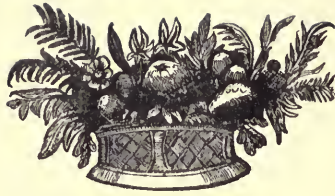
ILLUSTRATION TO VOL. LII